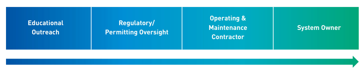
Figure 1 A spectrum of utility involvement in ONWS

Utilities have a wealth of knowledge in how to effectively operate water and wastewater systems, from operations to monitoring, maintenance, and much more. As customers and others in their service territory are exploring onsite reuse projects, utilities can be one of the best resources for planning and implementing them. Beyond providing outreach and education to developers, commercial customers, and property owners, utilities can champion ONWS by building public and political support through education of the general public and government officials.