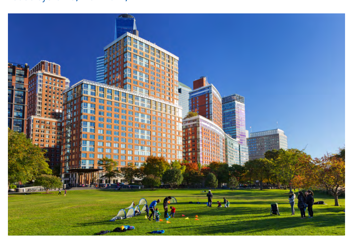
Battery Park City redevelopment area, home to six residential water reuse systems, New York, NY.