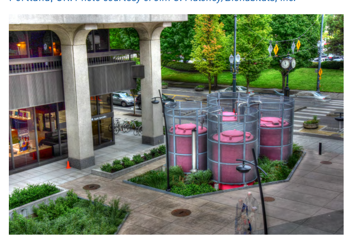
Natural Organic Recycling Machine (NORM) at Hassalo on Eighth, Portland, OR.